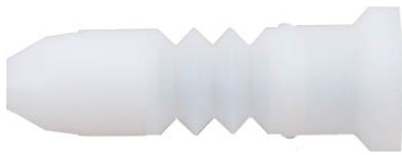
I40 Valves Item no. 310055 (56mm)