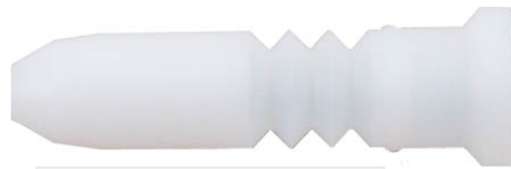
I52 Valves Item no. 320055 (68mm)