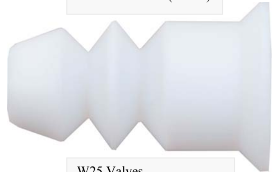
W25 Valves Item no. 870055 (83,5mm)