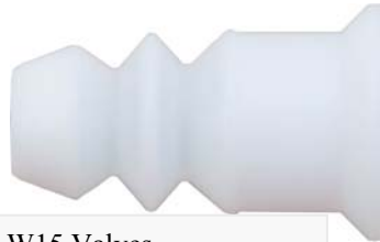
W15 Valves Item no. 860055 (51mm)