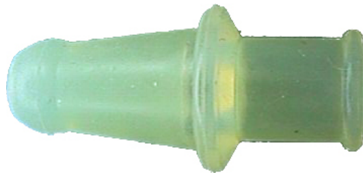
Old Combi valve Item no.: 900001